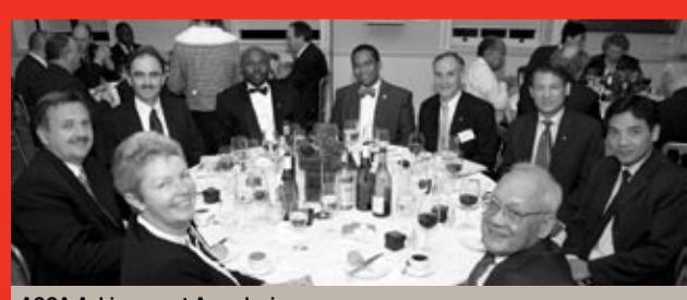
ACCA Achievement Award winners